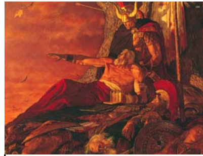
Mormon and Moroni

And now, I would commend you to seek this Jesus of whom the prophets and apostles have written, that the grace of God the Father, and also the Lord Jesus Christ, and the Holy Ghost, which beareth record of them, may be and abide in you forever. Amen.